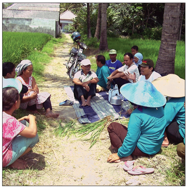
Indonesian Field School farmers discuss the ecological management of insect pests found in their paddy fields.

Collaborative structures that emphasize co-learning, social networks of innovation, and building capacity in flexible place-based decision-making have proven more effective than conventional top-down transfers of technology in the developing world. Partnerships that focus on inclusion and meaningful participation, particularly by historically marginalized groups, contribute to the design and implementation of solutions that are robust precisely because they are appropriate.